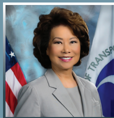
Left: Transportation Secretary Elaine Chao spoke to NMHC members during the Fall Meeting.