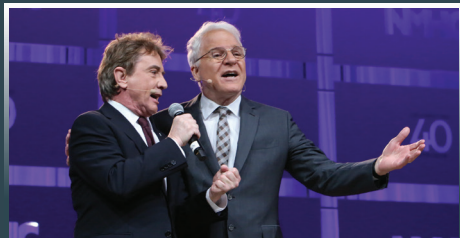
Left: Steve Martin and Martin Short entertain NMHC members at the 2018 Annual Meeting.