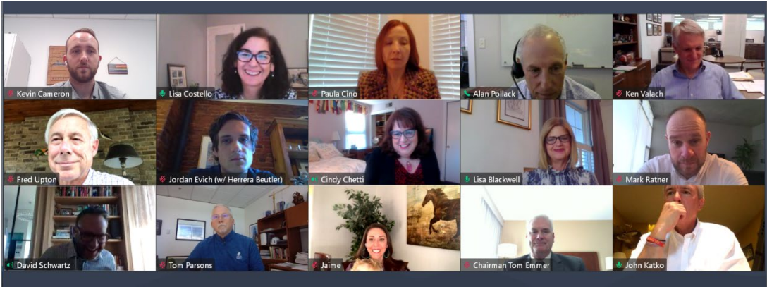
NMHC PAC Roundtable with NRCC Chairman Tom Emmer (R-MN) and Republican Members in competitive reelection races