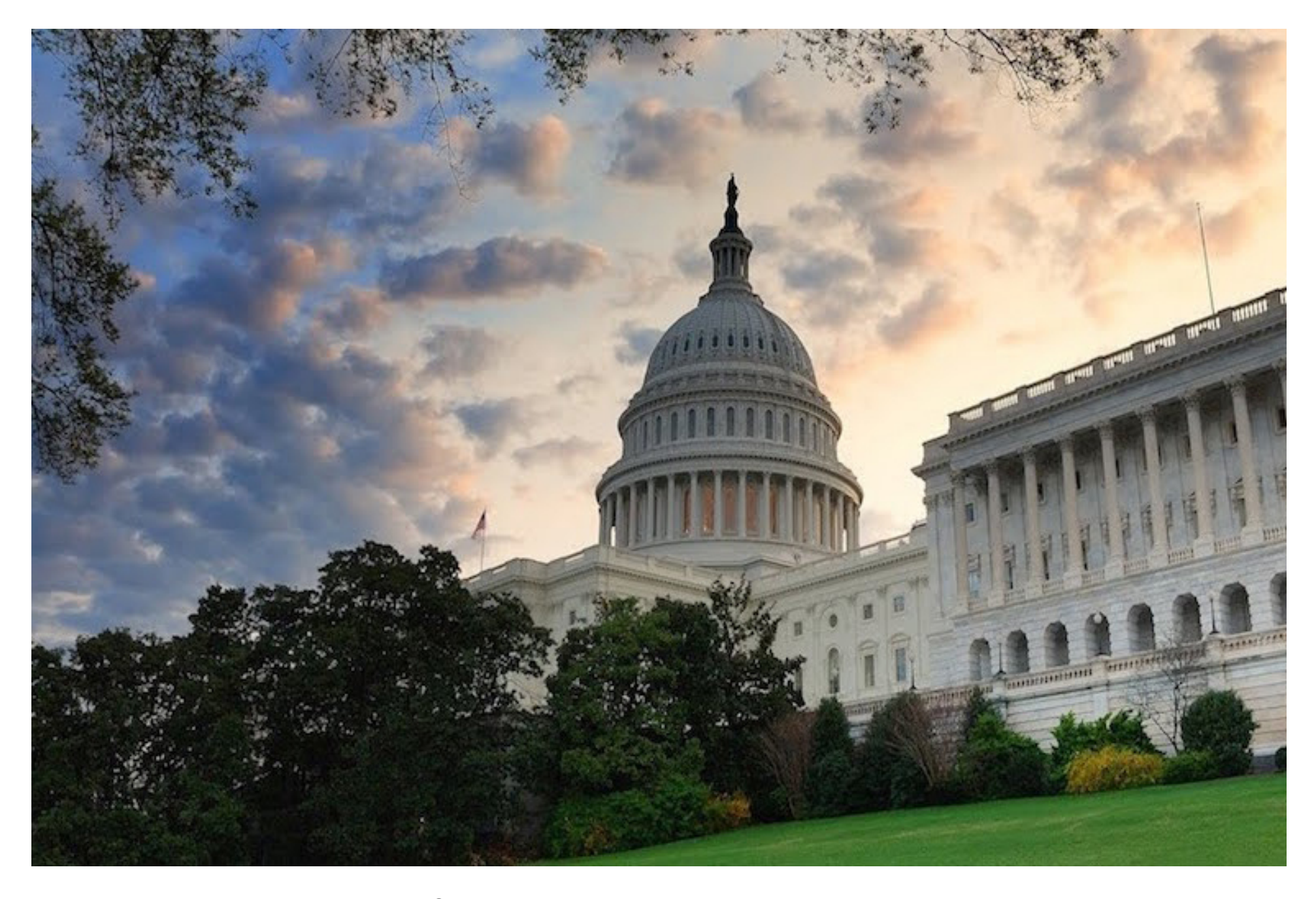
White House Holds Eviction Mitigation Summit: The Biden Administration has doubled down on its promise to continue eviction mitigation efforts by hosting a <u>virtual summit</u> this week to discuss future actions in this space and highlight states and localities that they feel are "getting it right."