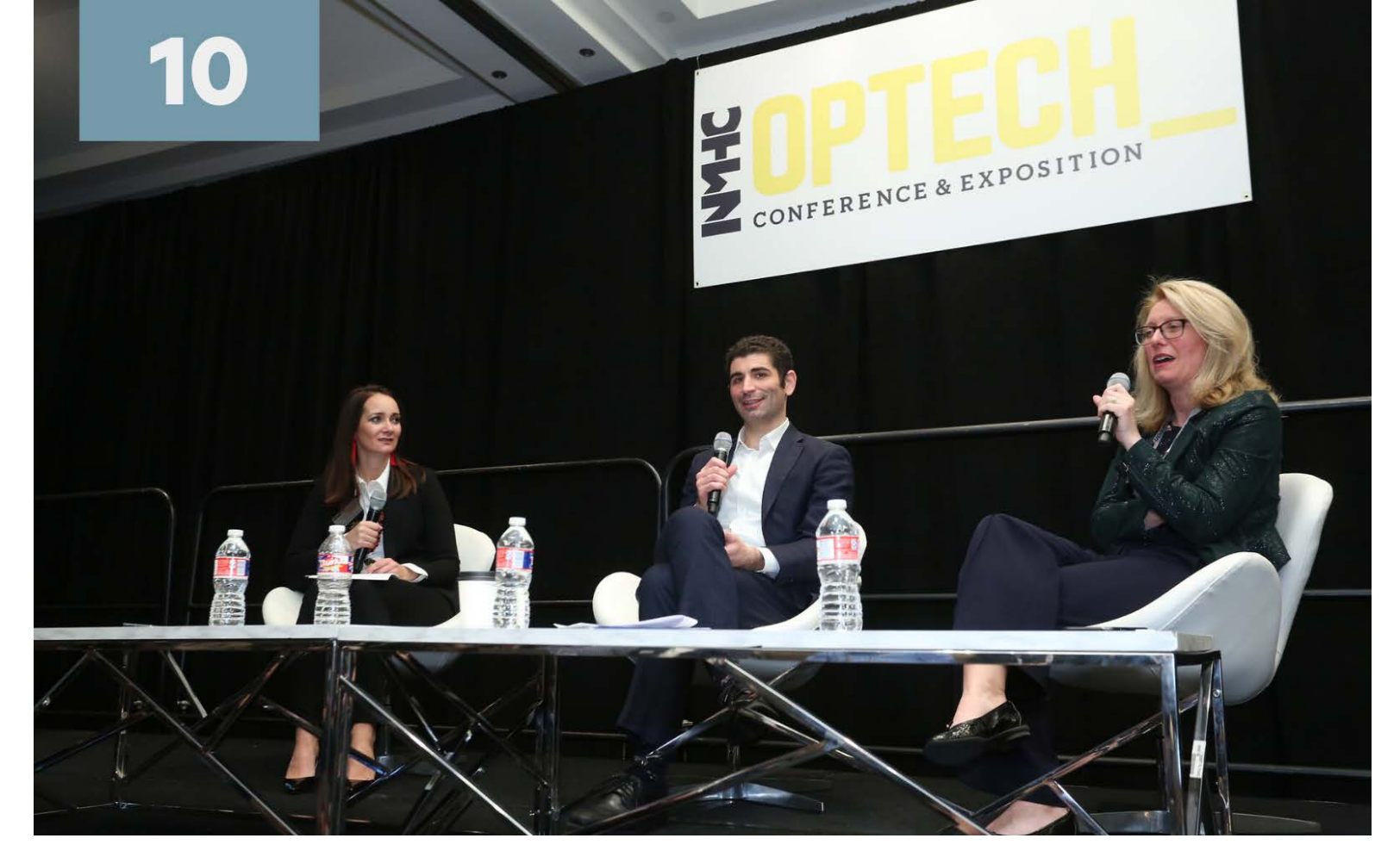
The future is here.

The apartment of tomorrow is closer to today than you might think. Machines are already reshaping the construction process. Artificial intelligence and automation are simplifying operations. Fintech innovation is upending traditional models of investment and ownership. It's all already happening in the here and now.