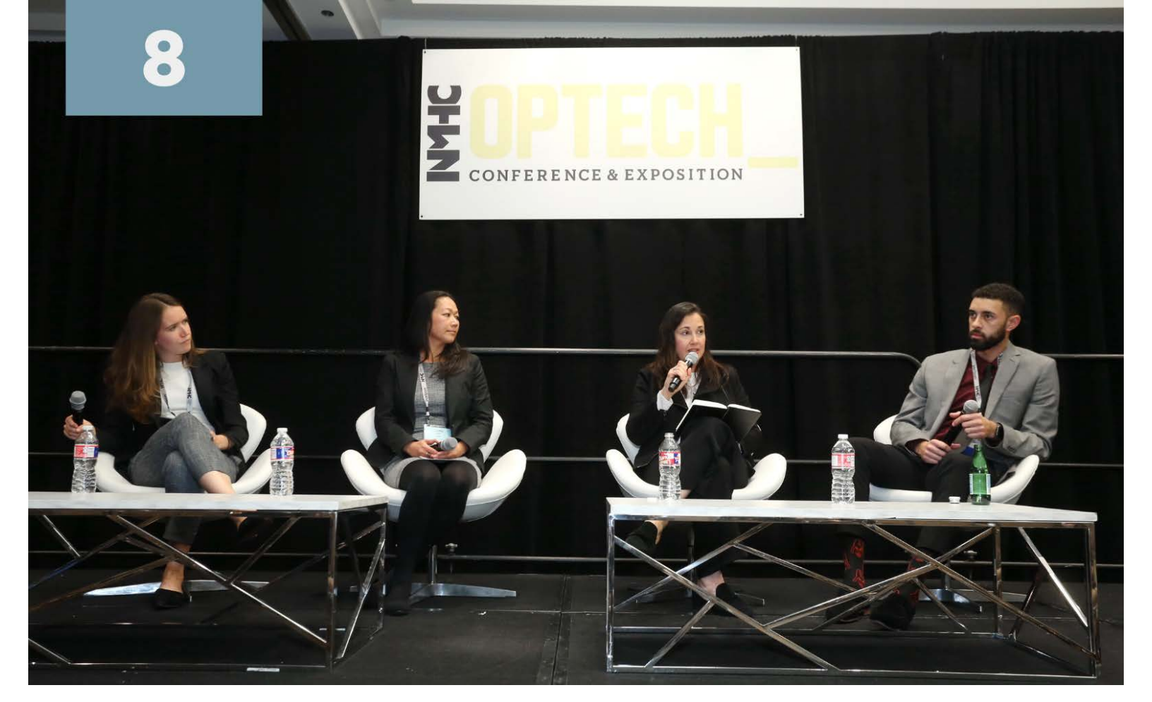
Wellness is mainstream.

With the growth of various certifications, the apartment industry has undergone a major shift in its approach to health and wellness. We've moved beyond a risk-reduction model focused on ensuring our buildings are safe environments, free from the harmful effects of things like asbestos, mold and second-hand smoke, to an active promotion of health and wellness as core lifestyle and community components.