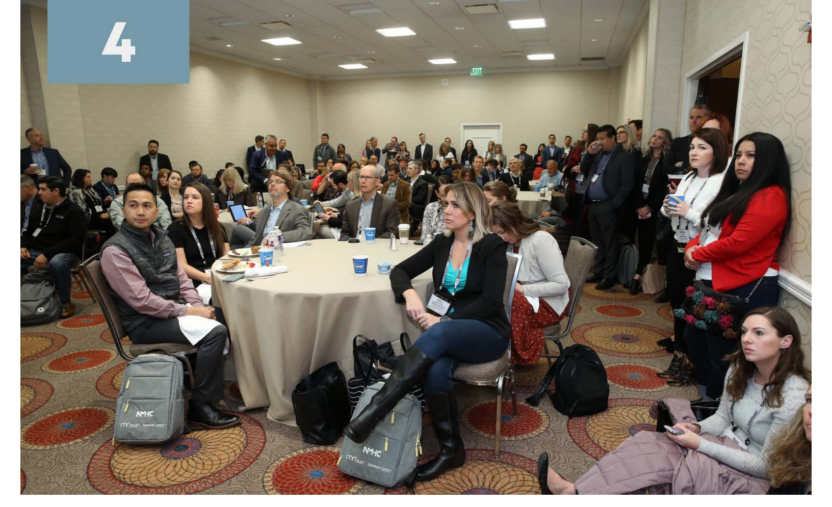
Regulation goes digital.

Tech and innovation happen fast, but the laws are catching up. Regulators are now taking <u>a closer look at digital marketing and advertising practices for possible Fair Housing infringements</u>, as well as significantly upping the ante with respect to data privacy. With <u>new, more stringent laws set to go into effect on January 1</u>, tech and legal executives met with the big four property management system providers to discuss compliance strategies during <u>a special post-OPTECH data privacy summit</u>.