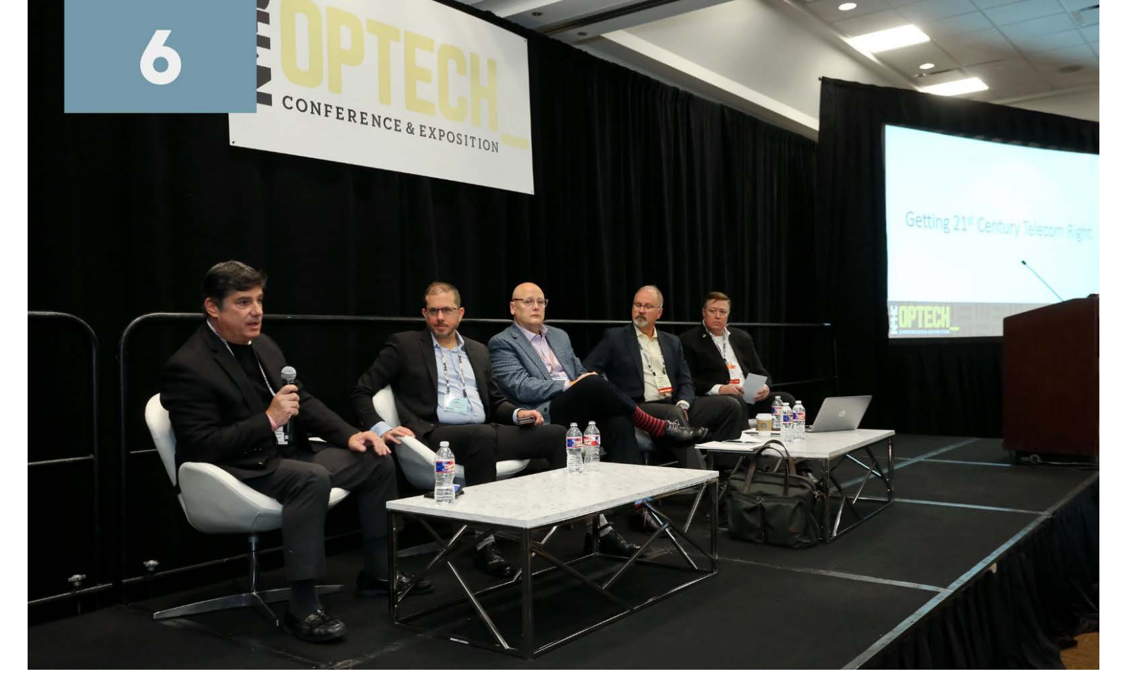
Please hold while we connect you.

Two new and interesting telecom advancements remain elusive for most multifamily operators. While the promise of 5G and CBRS are great—better, faster and more reliable mobile connectivity—the reality of when we'll start to reap the benefits remains something of a mystery.