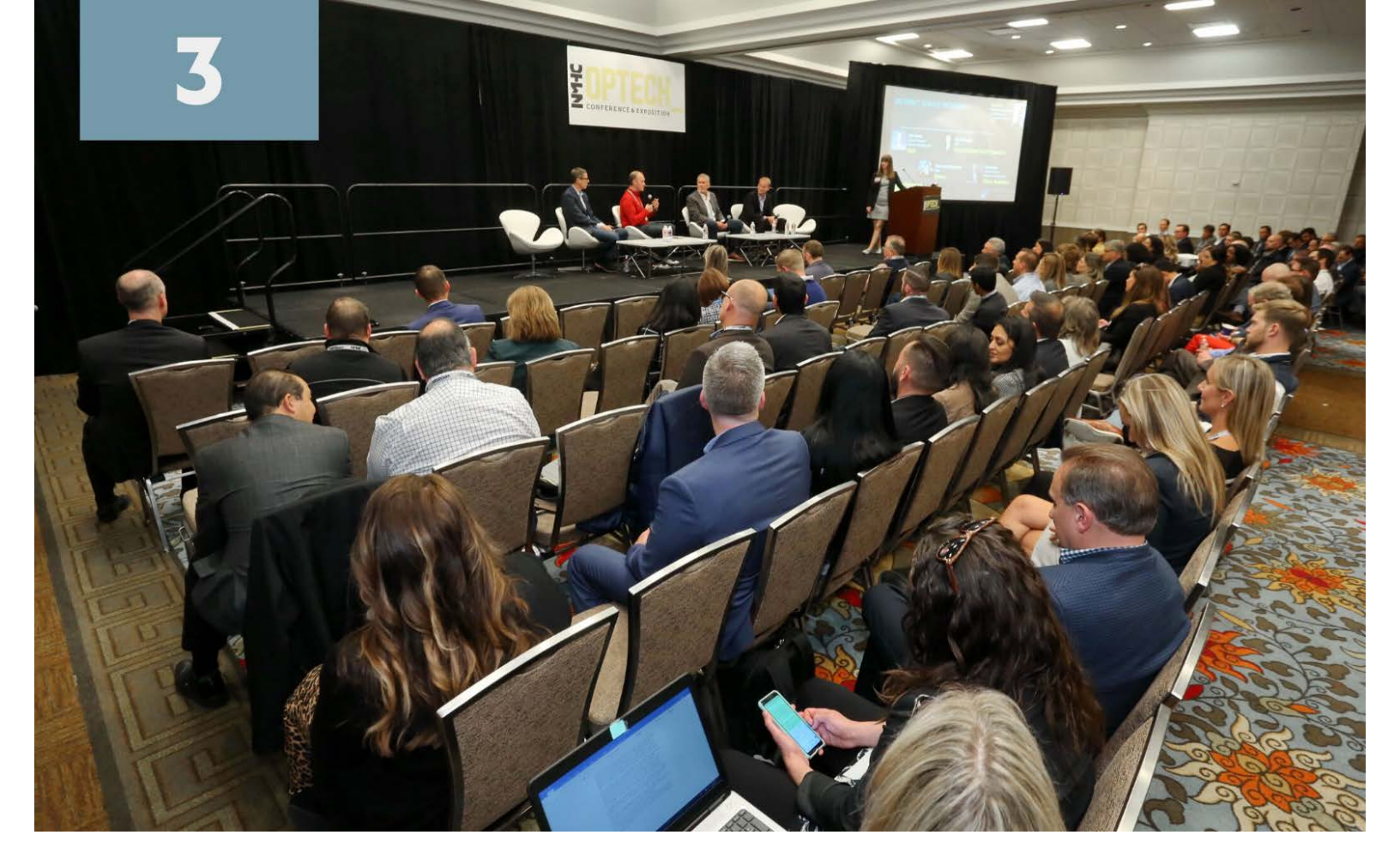
Curb to community room connectivity is critical.

Residents certainly want it, but increasingly our buildings' systems are also demanding seamless connectivity. From controlled access to sensor technology, futureproofing begins with getting the broadband and cellular infrastructure right.