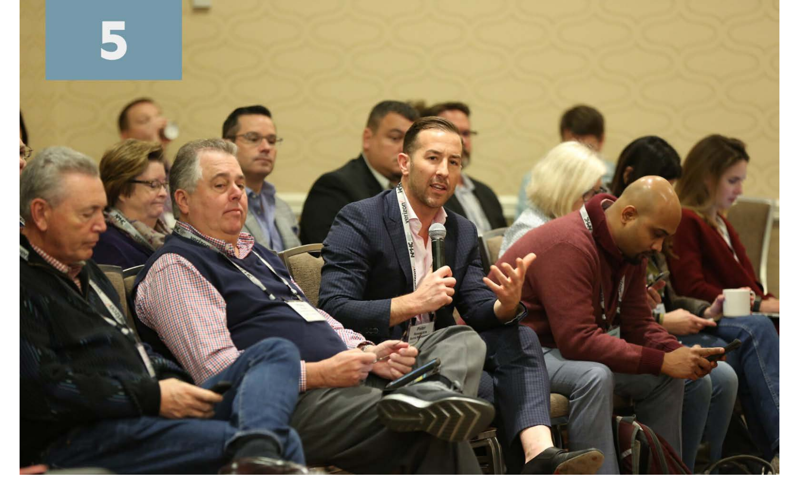
Smart is in.

While apartment operators haven't quite found the perfect solution, most are testing the smart home waters and figuring it out as they go. With the benefits of consumer-facing smart tech going to the resident, they're also looking at smart building tech for operational efficiencies.