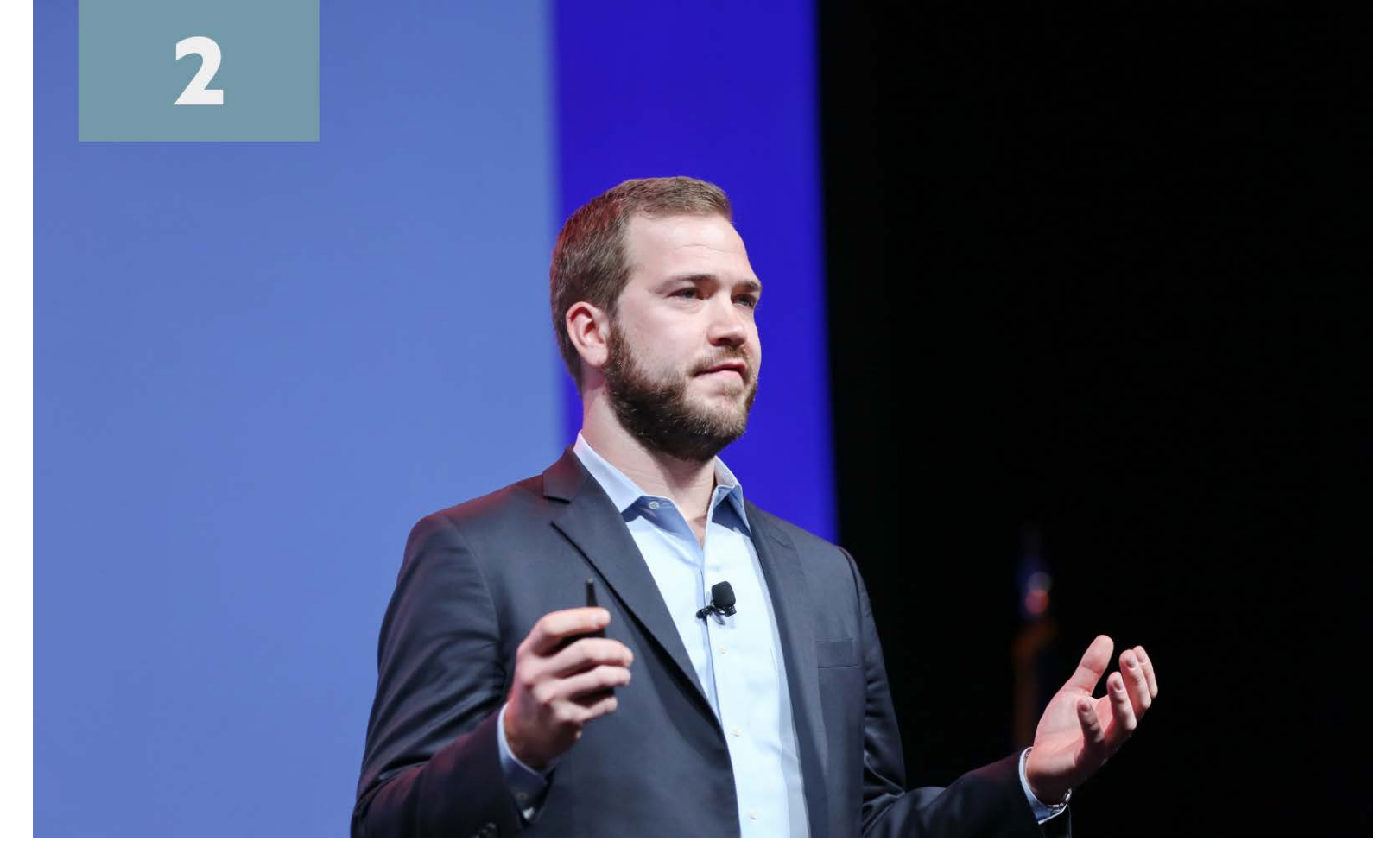
We asked, residents answered.

The newly released 2020 NMHC/Kingsley Associates Apartment Resident Preferences Report, the industry's definitive resource for what residents like, love or won't rent without, is out—nationally and for 104 individual markets. Nearly 373,000 residents participated, weighing in on the search process, lease decision factors, community amenities, unit features and the latest tech trends, including things like voice-activated technology, virtual tours, facial recognition, coliving and more.