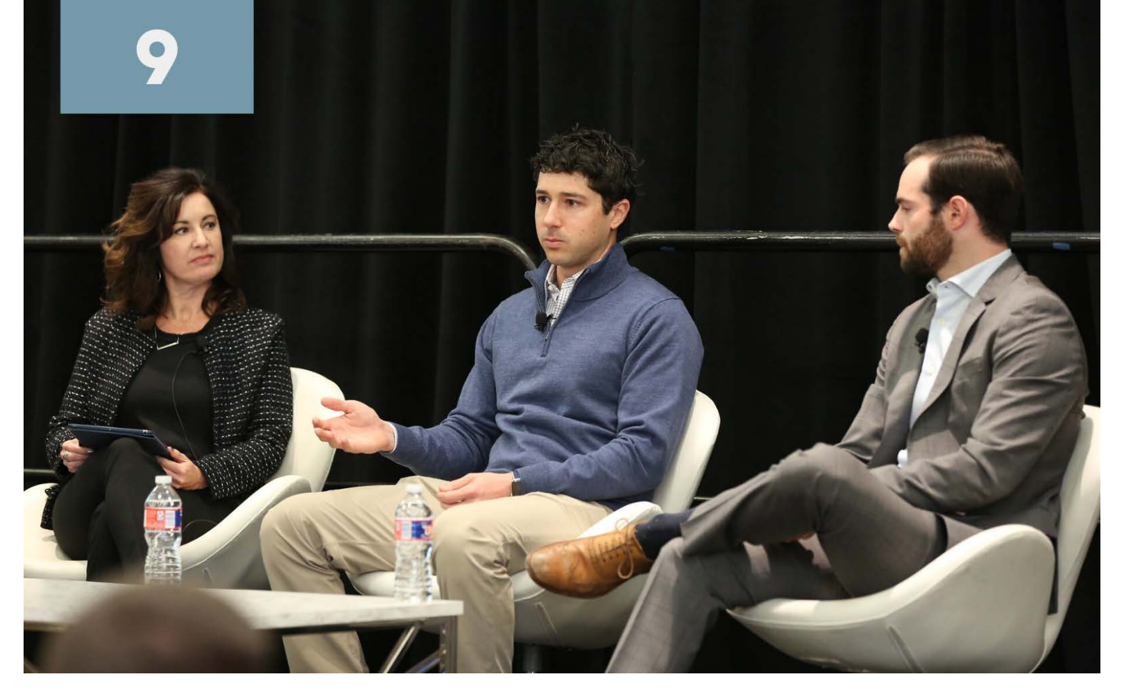
After innovation comes consolidation.

This has been a very active period of tech innovation, and experts now expect to see more consolidation as winners and losers begin to emerge. However, it won't all be up to the owners and operators; industry-focused venture capital firms are taking an active role in influencing markets.